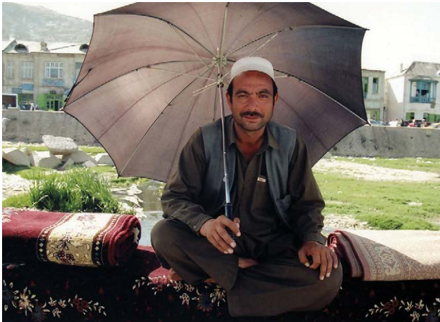
Taken in Kabul where Integrity currently supports the World Bank: Afghan Reconstruction Trust Fund